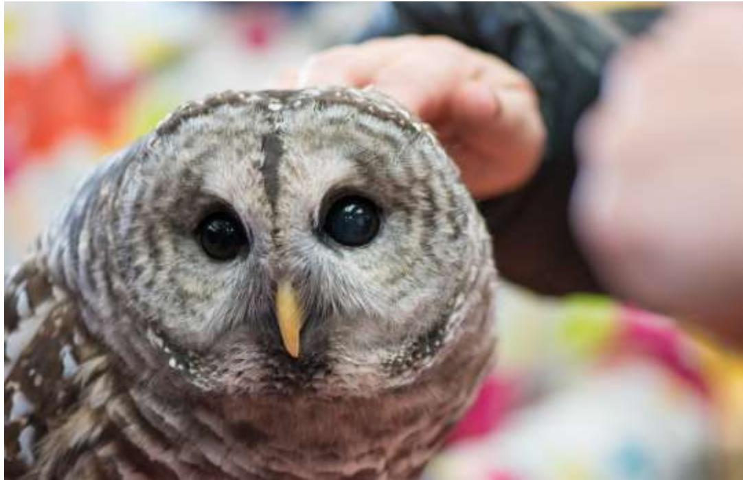
Figure 2. Colonel Slade at the Wild Bird General Store discussing bird conservation to the public.