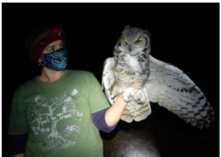
Sara, our head biologist, posing with a Great Horned Owl: a rare catch!

Myrtle Warblers, although thinning out, continue to inhabit the poplars of the natural area, joined by our resident nuthatches and a hearty number of Slate-Coloured Juncos. Geese also are passing overhead in large numbers; over the last three days of this report period, we recorded over 6,000 Snow Geese passing over the natural area!