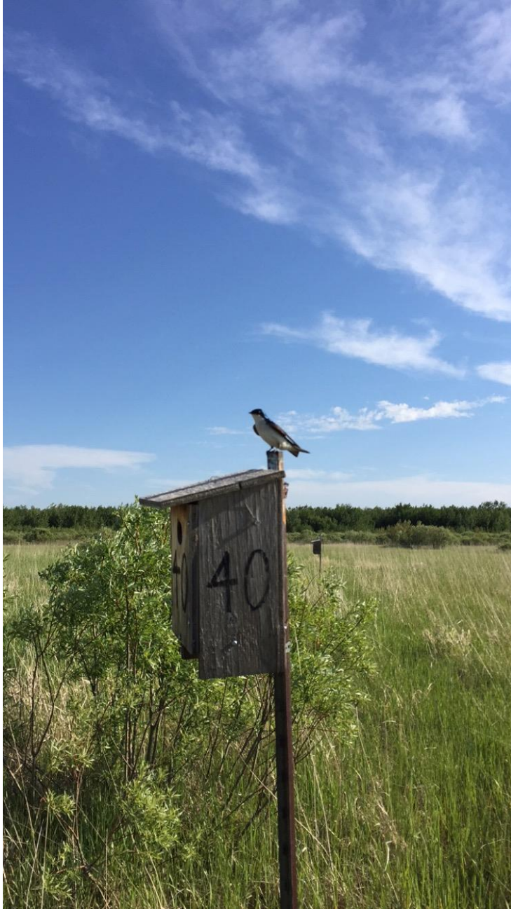
Figure 2. Example of nest box from the weir grid

Nest boxes were initially checked to see if a nest was present. Next, data was recorded based on the completeness of the nest: 'G' represented the presence of grass in the nest box, 'C' showed that the nest was in a cup shape, and 'L' meant that the nest had