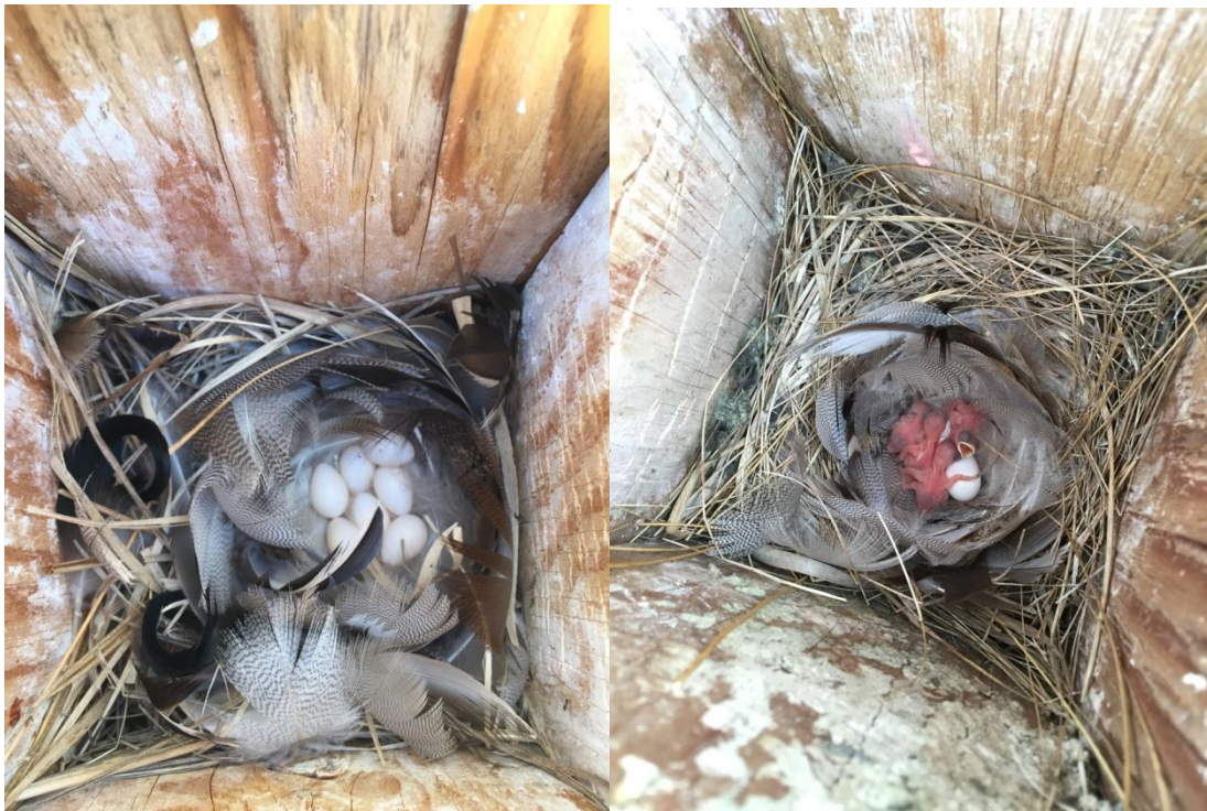
Figure 3. Left photo showing a nicely formed grass cup with a heavy feather lining. Right photo shows newly hatched chicks at the beginning of the monitoring period.

been lined with feathers. After the first egg was laid, data was recorded solely on the presence of eggs and the number of young. The nestlings were recorded based on number, but also on age, this allowed for the banding of the T. bicolor chicks after they were confirmed to be past the age of 12 days.