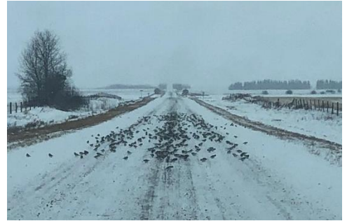
A flock of Snow Buntings

This winter the BBO initiated a Snow Bunting project in partnership with the Canadian Snow Bunting Network (CSBN) to monitor their population dynamics, overall health, responses to weather changes, and movements. This project involves locating flocks of Snow Buntings and using baited traps to capture and band them. So far, we have been unsuccessful in catching Snow Buntings; however, we are still learning about them and just how nomadic the buntings are.