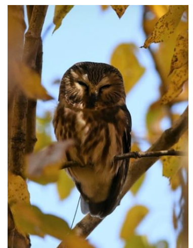
A Northern Saw-whet Owl perched on a branch with a nanotag

BBO's MOTUS station was operational and connected to the global network in early May, after fixing our solar power system. Detections this year include, White-throated Sparrow (4), Bank Swallow (25), and Swainson's Thrush (1). It's exciting to see more species and individuals detected each year. Additionally, 36 Northern Saw-whet Owls were detected, all of which were tagged at the observatory this fall. With 13 towers in Alberta already, and more being installed every year, we expect more projects and many more detections in the years to come.