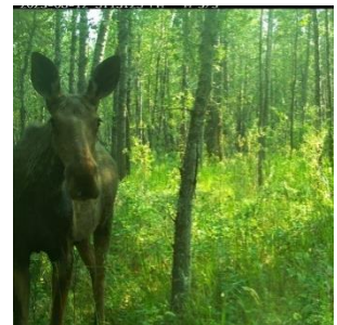
A moose captured on one of the trail cameras

Three trail cameras successfully monitored the mammal populations within the Natural Area. The cameras are serviced twice each year to download photos and replace batteries. The photos are analyzed, and the data is submitted to Alberta Parks and WildTrax. The most common species observed are White-tailed and Mule deer, moose, and coyotes. Neither skunks or porcupines were detected this year and, importantly, neither were wild boar.