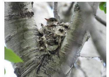
Least Flycatcher on a nest

BBO staff and volunteers successfully located and monitored 48 natural nests including those of the Least Flycatcher (36), Yellow Warbler (2), American Robin (3), Yellow-bellied Sapsucker (2), Gray Catbird (1), Tree Swallow, and Baltimore Oriole (1). The Tree Swallow nests were in natural tree cavities, which is worthy of noting. The staff also used the pole camera to explore a snag with multiple cavities and found a House Wren, Yellow-bellied Sapsucker, a Tree Swallow nest, and what was likely a cavity used by a Northern Flying Squirrel all in the same tree.