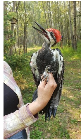
A Northern Shrike, a Blue Jay, the first ever Baird's Sparrow at BBO, and one of 4 Pileated Woodpeckers captured this year.