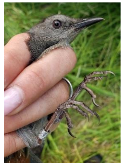
A Baltimore Oriole, Warbling Vireo, Rose-breasted Grosbeak, and Gray Catbird. Common captures at our MAPS stations