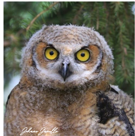
The newest education ambassador birds. Nina the Burrowing Owl, Keith the Red-tailed Hawk, Tansi the Great Horned Owl.