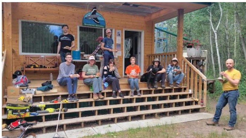
Volunteers having lunch at the work bee.