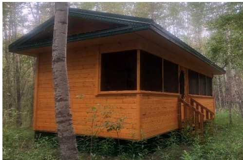
The newly built Nuthatch Nest bunkhouse

Summer operations included standard MAPS banding at our 3 stations – BLAB, SOPO, and LILA. Banding efforts this summer also included Tree Swallow, Purple Martin, and Northern Saw-whet Owl nestlings. Additional monitoring projects took place over the summer season, including the continuation of the Forest Breeding Bird Census, the Least Flycatcher nest monitoring, and the Marsh Monitoring Program. Staff initiated projects including Shorebird Surveys, a vegetation inventory, a protocol for monitoring invasive plants in the area, and winter Snow Bunting monitoring. Staff also worked on stewardship and maintenance activities like fence repair, maintaining trails, installing a handwash station at the outhouse, installing a road sign on Rowen's Route, updating the signage at the visitor parking, general upkeep of the field facilities, and launched an online merchandise store.