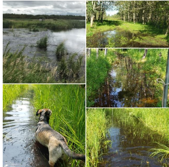
The extent of the flooding in the natural area in July

The most frequent species caught was the Least Flycatcher (118), Yellow Warbler (52), Red-winged Blackbird (31), Tennessee Warbler (27) and Baltimore Oriole (23). The influx of Tennessee Warblers was first noted during MAPS banding and was notably interesting as staff observed no breeding occurrences in the Natural Area, but the warblers arrived in force in mid-July, well before migration would typically begin.