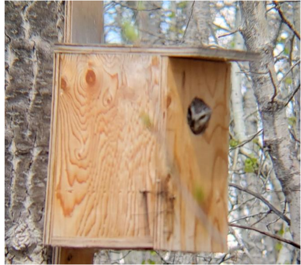
A Saw-whet Owl parent peeking it's head out of a nest box

Additionally, one of the 20 owl nest boxes was occupied by a pair of Northern Saw-whet Owls, who successfully raised 4 young, all of which were banded and successfully fledged. We hope to nanotag nesting owl adults and chicks in the coming seasons to better understand their breeding and nesting locations as well as their movements. If you would like to sponsor a tag and name an owl click here http://beaverhillbirds.com/get-involved/donate/