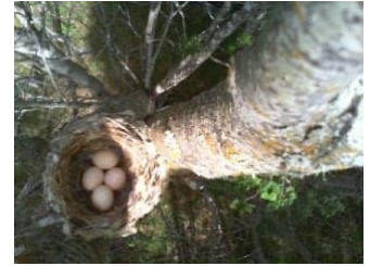
Least Flycatcher nest with eggs photo taken with pole camera.

The Least Flycatcher project continued this year with 24 new nests found and monitored for breeding, timing, clutch size, and nest outcomes. Nest clustering was also evaluated. Furthermore, 18 of last year's nests were relocated and monitored for reuse. Surprisingly, 8 (44%) of those nests were reused this year.