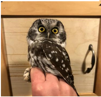
A Boreal Owl, the first captured in 4 years