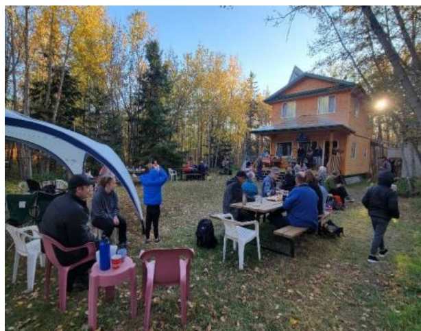
A crowd gathering for a Supper and Saw-whets event.