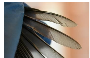
Feather mites seen on a flight feather