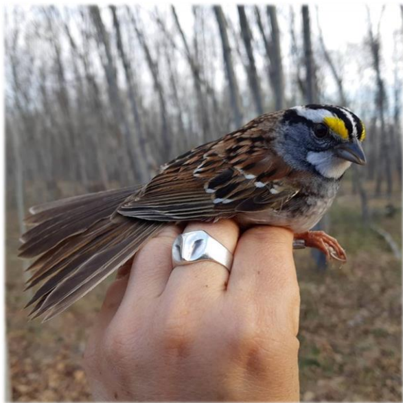
A white-throated Sparrow, like those that passed by the BBO MOTUS tower in 2022 and 2023.

Now that it's up and running, when a bird with a nanotag flies within 15 km of our tower, the tag's signal is picked up and its serial number is decoded. The record is then automatically sent to Birds Canada's central computer where the information is made available on their website www.motus.org . One word of caution: surfing motus.org can be addictive!