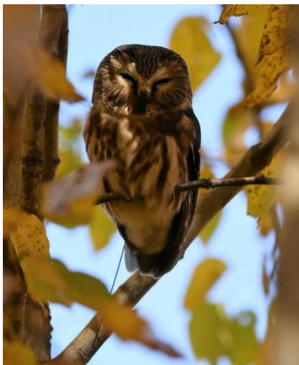
A Saw-whet Owl sleeping in the morning after getting a nanotag.