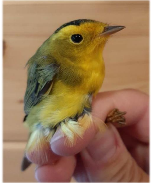
This adorable Wilson's Warbler was caught on August 8 th, far earlier than typical for the species!

While these timing differences are likely just yearly anomalies, they still provide an interesting insight into the lives of our birdy friends. It'll be exciting to see what the next season brings!