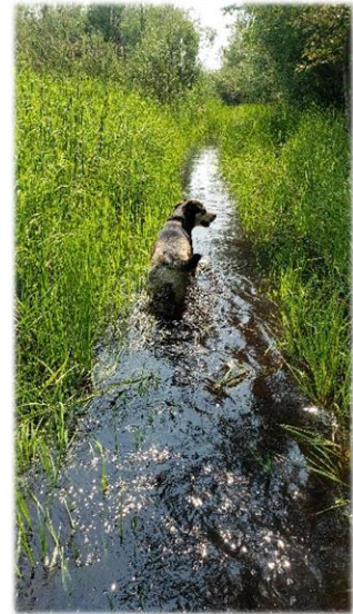
Flooding on Harrier Highway

The BBO was excited to initiate a project to track migrations of Saw-whet Owls using nano-tags in a backpack configuration which are detected by the MOTUS stations across North America. A resoundingly successful "Sponsor an Owl" fundraiser was launched in the spring, which funded all 50 nanotags. The nanotags were deployed on a variety of ages and sexes of saw-whets and we will be monitoring their movements closely for the next 2 years. (See the two articles in this issue about this project).