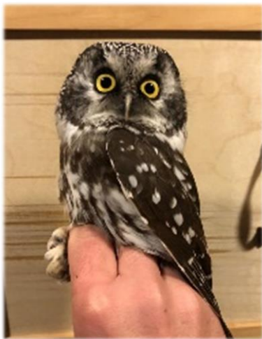
Boreal Owl

Heavy rain and flooding of the trails in July impacted our ability to operate rounds 9 and 10 of MAPS banding and prevented access to the BBO for some time. However, the biologists were excited to see herons foraging on Harrier Highway and to have pools of standing water at the historical shoreline of Beaverhill Lake. Despite the flooding, 428 birds were captured during the MAPS banding, 1077 birds during the Spring Songbird Migration Monitoring, and 3050 birds during the Fall Songbird Migration Monitoring. Additionally, 190 Tree Swallow and 39 Purple Martin nestlings were banded. The owl banding season started with captures on opening night, surprisingly. A total of 294 Northern-saw Whet owls, 11 Long-eared Owls, and our first and only Boreal Owl since 2019 were captured, bringing our total captures for 2023 to 5090 birds. Along with the owls, a whopping 7 Northern Flying Squirrels were captured in the nets, which seemed to have had a successful breeding season thanks maybe to the moisture-loving mushroom crop. Highlight captures from the season included 4 Pileated Woodpeckers, 2 Blue Jays, a Baird's Sparrow, a Northern Shrike, and, of course, the Boreal Owl!