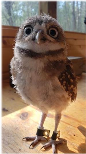
Nina, the Burrowing Owl

Three new education ambassador birds joined the BBO this year – Tansi the Great Horned Owl, Nina the Burrowing Owl, and Keith the Red-tailed Hawk. The biologists had the pleasure of hosting the owls at the station for handling training for our winter BirdSmart Education Program where they travel to classrooms, afterschool groups, daycares, retirement facilities, and private events to present on birds, conservation, and climate change.