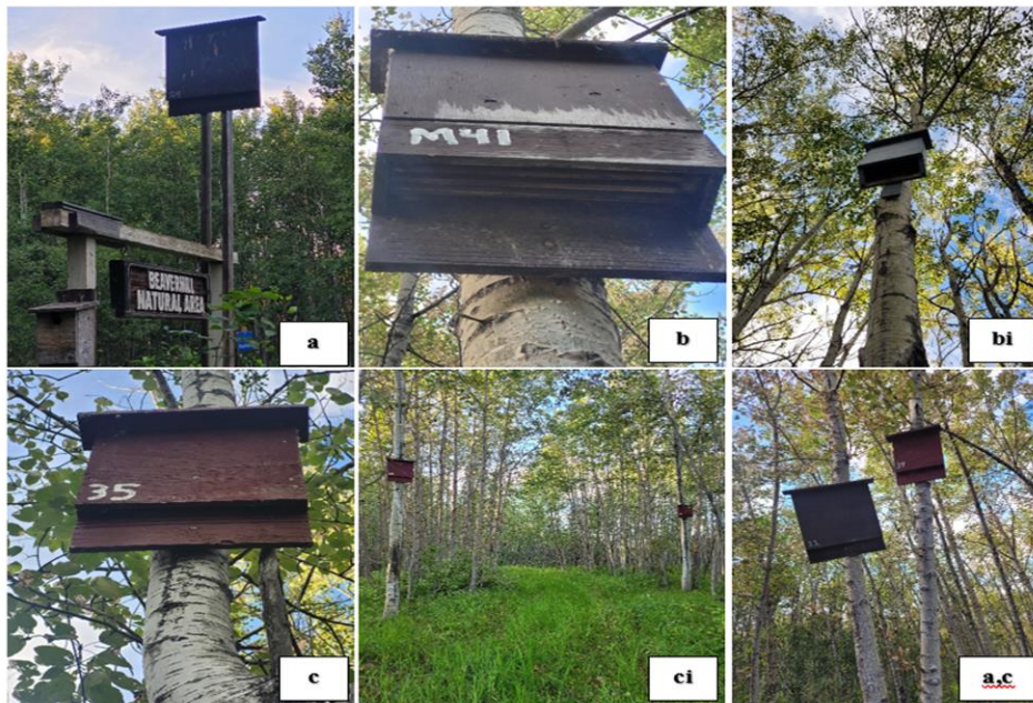
Beaverhill Bird Observatory bat house designs. (a) Large brown single chamber. (b) Brown large multi-chamber. (bi) Blue medium multi-chamber. (c) Small red single chamber. (ci) Small red single chamber on edge habitat. (a,c) Large brown single chamber (left) and small red single chamber (right).