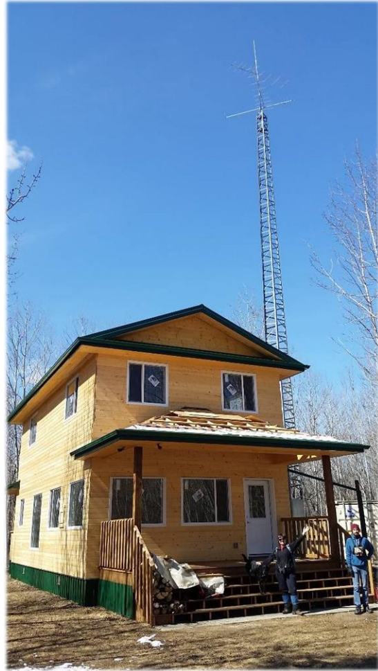
BBO's 80' communications tower with MOTUS antennae, and cell and WiFi dishes on top.

The swallows from Whitehorse and Fort St. John were not as fast, presumably because the swallows stopped somewhere en route or just weren't pick up by the local MOTUS stations. Some appeared to stay for a few days at Beaverhill Lake, but most were only detected briefly. However, two were only briefly at Beaverhill but then detected 24.5 and 27 hours later near Brandon, Manitoba for an average speed of 34 and 37 km/h, respectively. These swallows flew right past Beaverhill then overnight to cross Saskatchewan! Another swallow was south of Saskatoon, 282 km from BBO in 9 hours for an average speed of 29km/h. These 25 swallows demonstrate that Beaverhill Lake is an important migration site for the western populations of Bank Swallows. Between the sparrows, the swallows, and the owls (see the next article), the installation of MOTUS has begun to paint a deeper picture of the lives of birds that pass by the BBO and rely on Beaverhill Lake. The ability to glimpse into the lives of migratory birds in this way is exciting – a privilege that previous generations could only dream of. The early returns on the MOTUS station can only be described as a resounding success. The question is, what will next year hold? Stay tuned to find out!