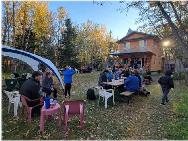
Guests enjoy a meal at the observatory on a summer evening.

We had the pleasure of hosting over 100 ticketed guests for our annual Supper and Saw-Whets event over two nights, October 23 rd and 24 th . The owls were a bit slow to appear on the first night, and it wasn't until late that we captured two saw-whets. On the second night, however, they showed up in droves and we captured 10 saw-whets without much delay. Among these was our 100th owl for the season!