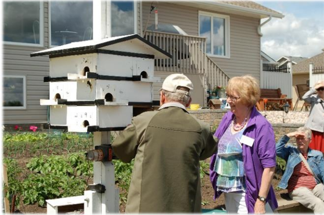
Two landlords attend to a Purple Martin nest box.

We were able to compare these management practices with our annual records of nest box occupancy by martins in those nest boxes. We calculated the percent of years a nest box was occupied, the average percent of nesting holes occupied, and whether martins were present or not during those 3 years.