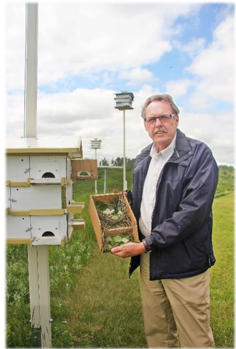
A Purple Martin landlord proudly displays a clutch of eggs.

Today, many people get satisfaction from acting as “landlords” for Purple Martins, by building and maintaining nest boxes. The proper design, location, and management of martin nest boxes is critical to attract nesting martins. Therefore, successful martin colonies require knowledgeable and committed landlords to manage nest boxes. Landlords have varying levels of knowledge, engagement, and methods to support martins, based on martin guides, anecdotes, and shared wisdom about best practices to attract martins. To date, however, we have little scientific knowledge about which methods work best to maximize on martin occupancy in managed colonies. Ultimately, if landlords do not put up nest boxes or manage them poorly, martin populations will likely decline. It is also important for landlords to know that their efforts are making a difference for martin conservation.