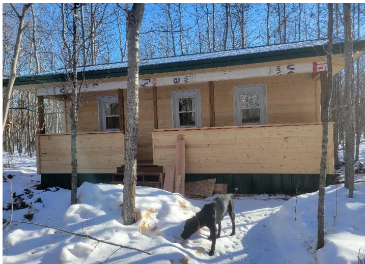
The new bunkhouse, ready for spring activities.