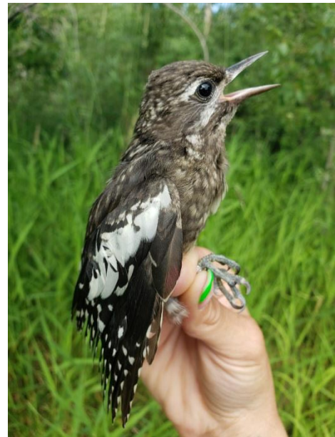
A fledgling Yellow-Bellied Sapsucker, still fully in juvenile plumage.

The MAPS program is a protocol standardized across North America and used to assess the breeding status and condition of land birds during the summer, and is geared to provide a detailed overview of nest productivity, fledgling and adult survivorship, post-fledging activity and overall population. The protocol involves catching birds with ten 12m songbird mist nets once every ten day period at each station. Nets are opened at sunrise and monitored for 6 hours. Nets were closed in the event of inclement weather, namely precipitation, wind in excess of 20 km/h or temperatures above 27°C. The BBO has operated three MAPS stations since 1989, making it one of Canada's oldest MAPS operators. The BLAB station has been operating since 1989, and the more recently established SOPO and LILA stations have operated since 2016. This year we accumulated 635 net-hours and captured 477 birds across all three stations, for an area-wide capture rate of 75.1 captures/100 net-hours.