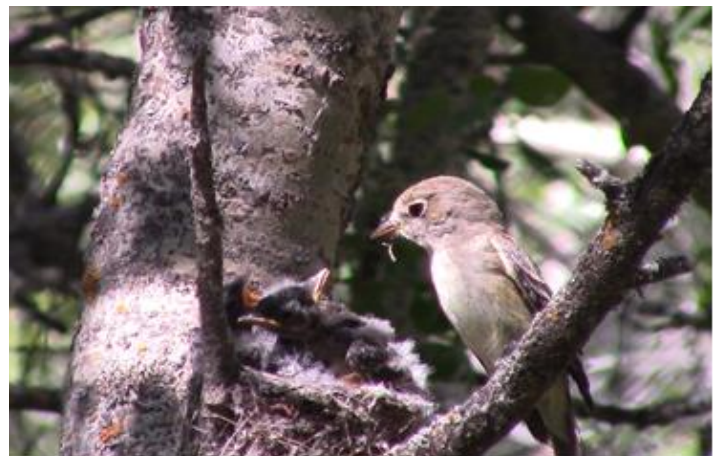
A Least Flycatcher feeds her four young at her nest.

Another regular summer activity is nest searches and recording incidentally found bird nests within the natural area. With the aid of Myrthe, our international volunteer, we were able to scale up our searching and commence a monitoring project specifically focused on Least Flycatchers, a very common local breeder. During a number of days of searching, Myrthe was able to find 36 flycatcher nests, which were then checked for progress every three days with a pole-mounted camera. More than half of these nests were successful, fledging an average four young. While searching for flycatcher nests, we also found a number of other nests (Table 1), which were checked throughout the summer for status and progress and the results noted for reporting to Nature Counts.