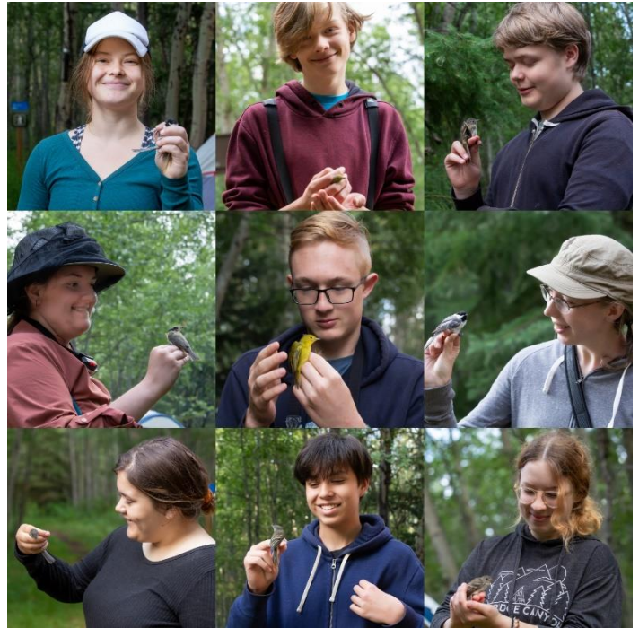
Several of the 2022 Young Ornithologists pose with one of their first banded birds.