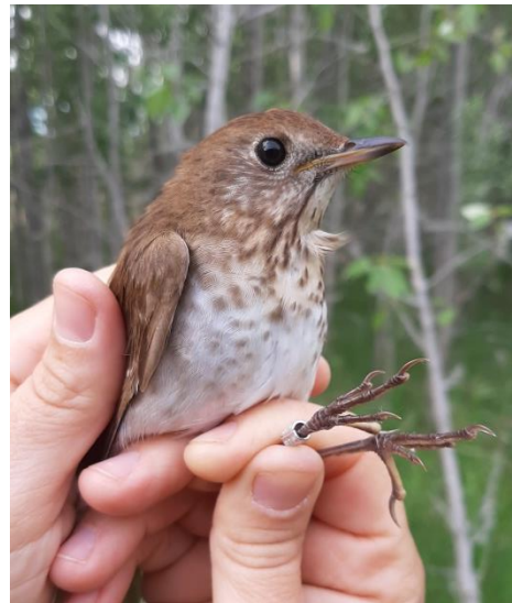
This Veery, an uncommon species of thrush in this area, was one of the highlight captures at SOPO.

SOPO was run on June 12 th , 21 st , July 1 st , 11 th , 22 nd and August 1 st . The six monitoring periods accumulated 275 net-hours, and captured 223 birds, for a total capture rate of 81.1 captures/100 net-hours, making it the most productive station for both capture rate and absolute volume. Red-Winged Blackbirds (48) were the most common capture, closely followed by Least Flycatchers (45) and Yellow Warblers (34). Other noteworthy captures were a Nelson's Sparrow (1), an Eastern Kingbird (1), a Blue-Headed Vireo (1) and a Veery (1), an uncommon bird in this region.