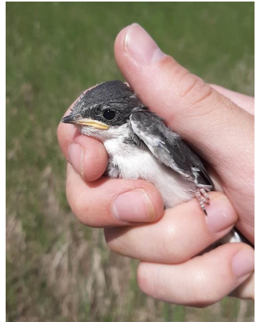
One of many Tree Swallow chicks banded at nest boxes this summer. They can be safely banded at only 11 days old!

Staff and summer interns monitored these nest sites, and banded Purple Martin and Tree Swallow chicks when they were at the appropriate age, as well as the two broods of Mountain Bluebirds that occupied one of the nest boxes on the road grid. After a painful period of waiting, staff were able to capture and band the male of the pair, and a stroke of luck allowed the capture of the female as well, who had already been banded at that same box the previous year. Staff were able to band over 400 chicks, mostly Tree Swallows, and were able to recapture two adults that had been banded as chicks the previous year.