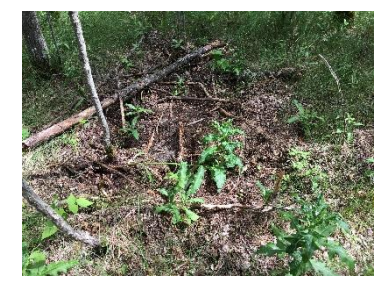
Suspected wild boar dig site in the Beaverhill Natural Area

Juvenile Fanklins Gulls have been dispersing and many have been sighted cluelessly wandering through the natural area. They don't seem to have quite figured out how to properly bird yet. American Coots may be found doing the same, and the muppet-like juveniles are often found wandering through the clearing