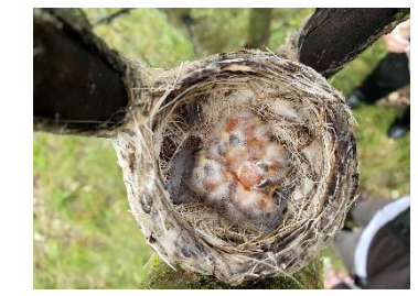
Adorable Least Flycatcher chicks that are just a few days old

The staff have been busy preparing the net lanes and setting up the 13 standard and 7 experimental nets for the fall migration. Yes, you read that right! The fall migration monitoring program starts on July 20, and staff will run the Migration Monitoring and MAPS programs concurrently until mid-August. Where did the summer go?!