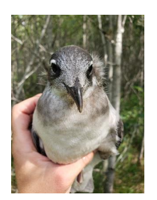
Fledgling Franklins Gull that was returned to the lakeside grassland

While banding at the MAPS stations near Lister Lake and Sora Pond, staff found a few dig sites and signs of possible Wild Boar in the natural area and around the wetlands. Although boars are suspected, they have not been confirmed.