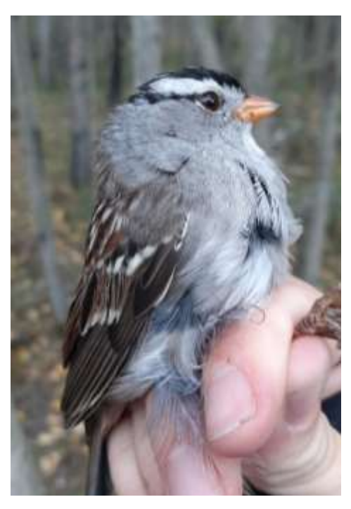
A handsome White-crowned Sparrow

The return of open water to Beaverhill Lake attracted thousands of Greater White-fronted Geese and Snow Geese, and hundreds of Sandhill Cranes were heard overhead in September. A number of Tundra Swans occupied Lister Lake into early November, and a Western Tanager was reliably spotted near the lab for over a week before it moved on. Woodpeckers also appeared to have experienced a particularly productive breeding season; Downy and Hairy Woodpeckers were very common throughout the fall and were captured with surprising frequency.