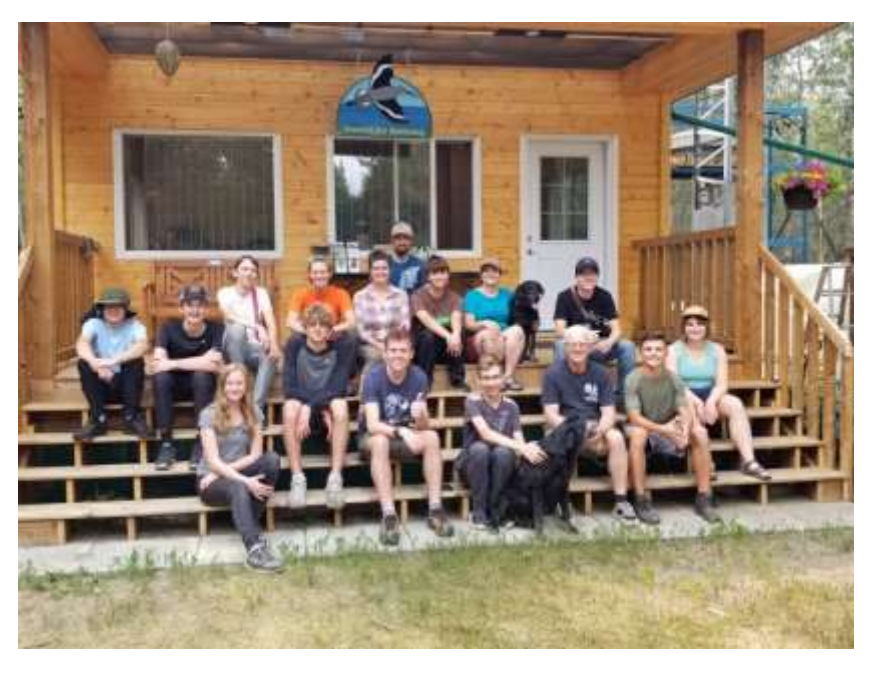
Group photo from the Young Ornithologists Workshop.

measurements, and ageing feather tracts. Throughout the program, 166 birds were captured, banded, and processed.