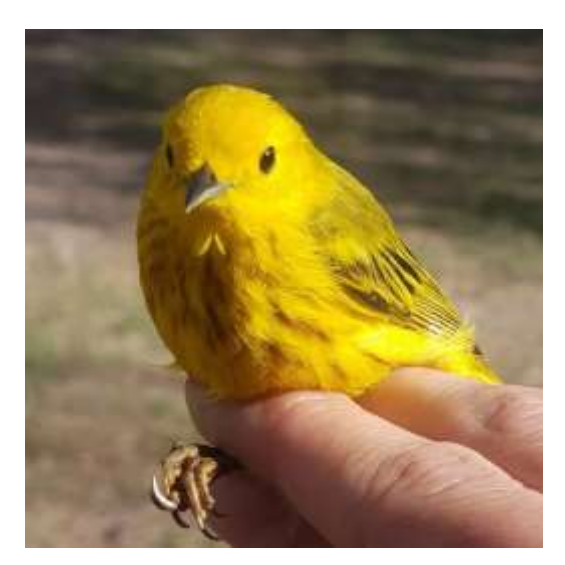
A Yellow Warbler that was originally banded at the BBO back in 2013, making this fellow at least 8 years

dismal numbers this spring include frequent cold mornings forcing nets to stay closed during peak bird activity, habitat succession along the static net lanes, or a poor breeding year.