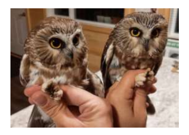
Left: Two Adorable Northern Saw-whet Owls.