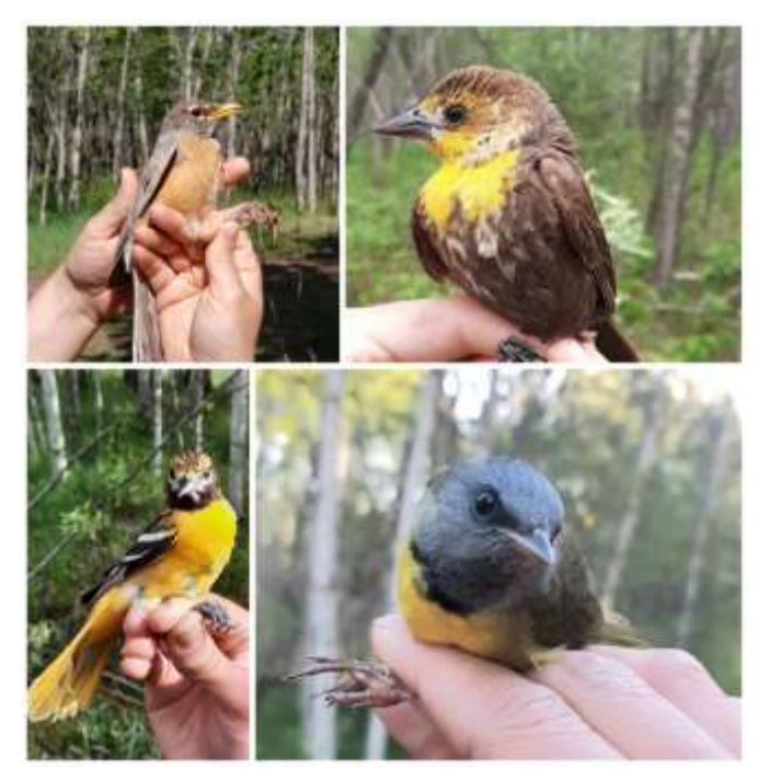
Some of the birds caught during spring migration monitoring (from top to bottom, left to right: a partially leucistic American Robin, a Yellow-headed Blackbird, a Baltimore Oriole, and a Mourning Warbler

May 29<sup>th</sup> to June 4<sup>th</sup> was our busiest week of spring migration with 92 captures, the highlights of which were Mourning Warblers, Baltimore Orioles, and a Gray Catbird. Other notable captures included several Yellow-headed Blackbirds, a Northern Saw-whet Owl, and a Yellow Warbler previously banded at the BBO that was at least 8 years old! Overall this spring was one of slow banding, having the lowest capture rate and second lowest number of captures in the last 15 years of spring migration monitoring at the Beaverhill Bird Observatory. Possible explanations for the