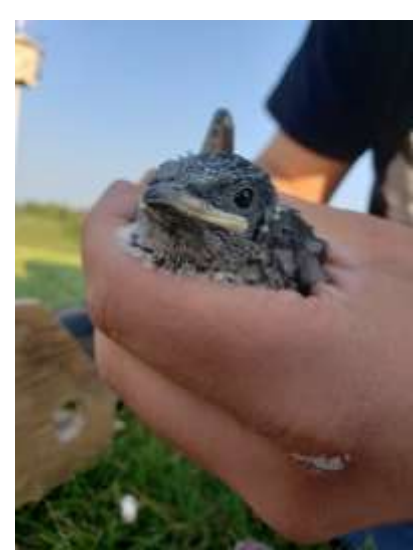
Purple Martin chick.