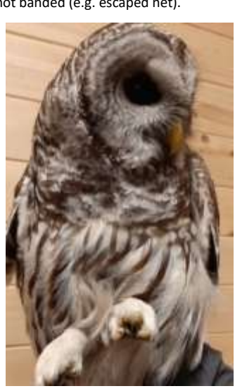
Right: BBO's first ever captured and banded Barred Owl!