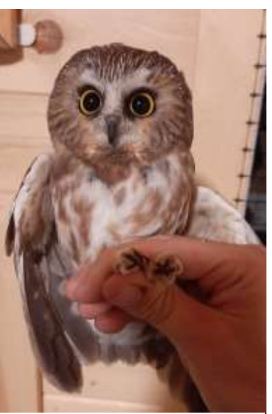
Visitors (and staff) just love the Saw-whet Owls!

enforced strict pandemic protocols for the whole season for staff and visitor safety, and were able to host that volume of visitors without incident. Visitors joined our biologists for a close-up look at the banding process and were treated to discussions about bird conservation, biology and climate change between checks or when captures were slow. Structuring our visitor experiences allowed us to be more prepared for them and give higher quality interpretation, which benefited both visitors and staff. In early November we hosted two field trips from Tofield School, during which approximately 90 students in Grades 7-9 joined us on site to learn about the local area's history and the importance of bird banding. After a guided walk through the natural area, the students were treated to a close up look of the bird banding process as we opened our feeder net to band resident chickadees and woodpeckers. We also hosted a Girl Guides group for a night of owl monitoring, where they spent 2 hours volunteering with us to help move wood and repair bird bags before we caught owls.