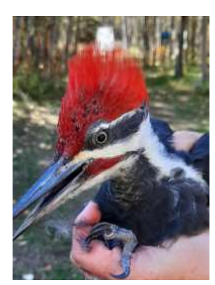
BBO's 3<sup>rd</sup> Pileated Woodpecker banded in 37 years of research!

Throughout the season, we accumulated 4,779 net hours in the standard nets and 386 in the experimental nets, and captured 1,117 and 827 birds in the standard and experimental nets, for a capture rate of 23.4 birds /100 net hours and 214.2 birds/100 net