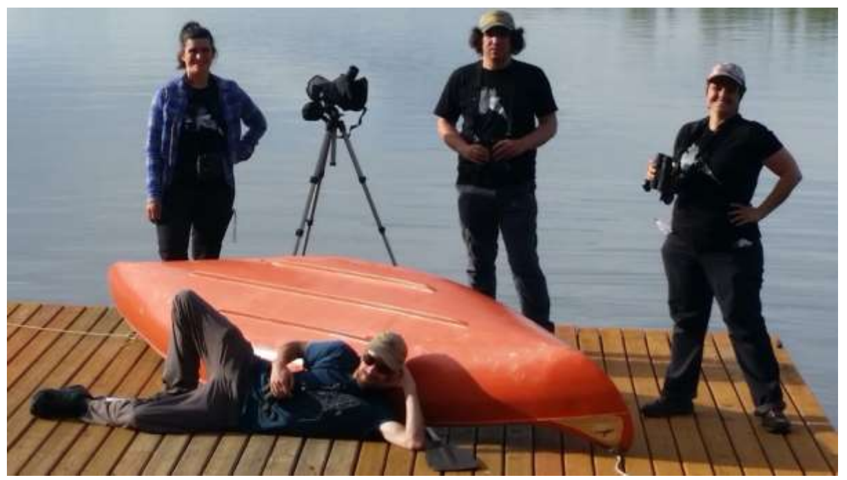
The BBO Staff relaxes on Geoff's dock after a long day of birding with the Beaverhill Bird Nerds Birdathon Team!

Beaverhill Birders Birdathon, seeing an incredible total of 123 species and raising around $2500! You can support our Birdathon at <a href="Great Canadian Birdathon">Great Canadian Birdathon</a> | Birds Canada | Oiseaux <a href="Great Canadian Birdathon">Canada</a> and search for Beaverhill Birders team.