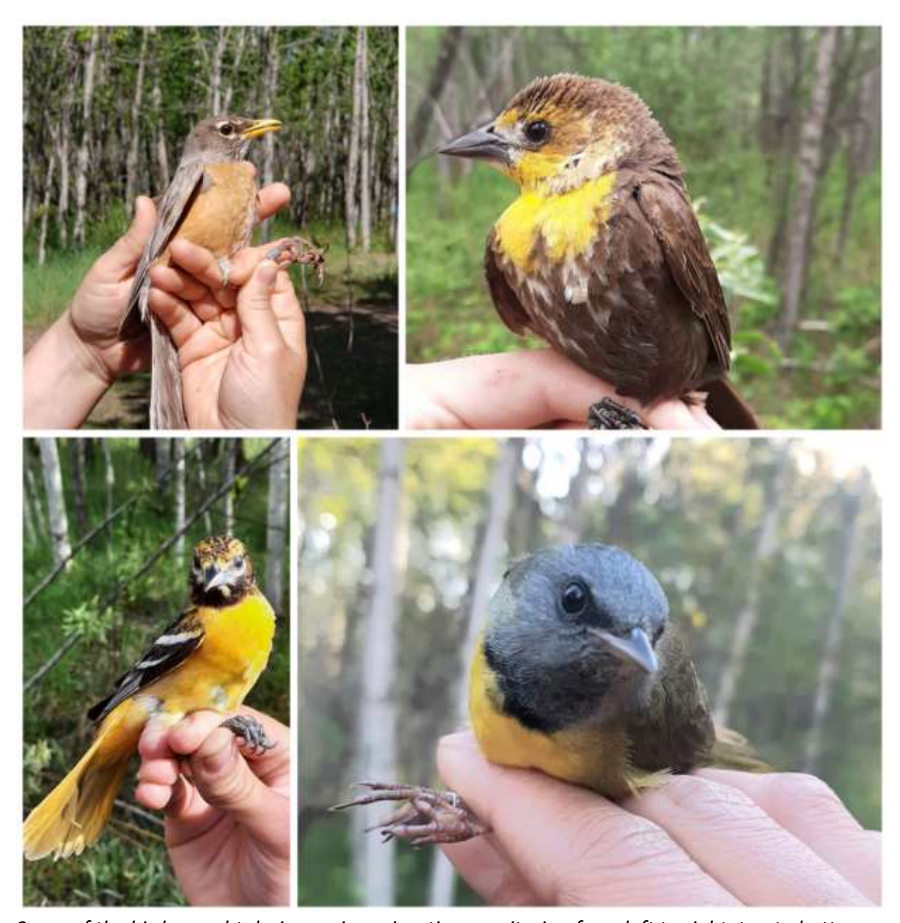
Some of the birds caught during spring migration monitoring from left to right, top to bottom: a leucistic American Robin, Yellow-headed Blackbird, Baltimore Oriole, and a Mourning Warbler.

The five most commonly caught species were Least Flycatcher (67 captures, representing 25.6% of all captures), Clay-colored Sparrow (23 captures, representing 8.8% of all captures), Swainson's Thrush (22 captures, representing 8.4% of all captures), Yellow Warbler (21 captures, representing 8.0% of all captures), and American Robin (21 captures, representing 8.0% of all captures)