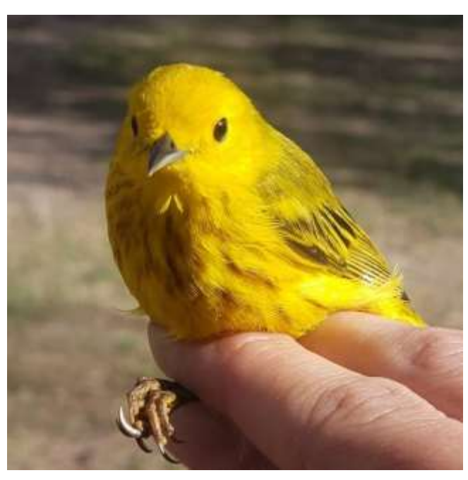
A Yellow Warbler that was originally banded at the BBO in 2013 was recaptured this spring, making this fellow at least 8 years old!

May 29th to June 4th was our busiest week of spring migration with 92 captures, the highlights of which were Mourning Warblers, Baltimore Orioles, and a Gray Catbird. Other notable captures included several Yellow-headed Blackbirds, a Northern Saw-whet Owl, and a Yellow Warbler previously banded at the BBO that was at least 8 years old! Overall this spring was one of slow banding, having the lowest capture rate and second lowest number of captures in the last 15 years of spring migration monitoring at the Beaverhill Bird Observatory. Possible explanations for the dismal numbers this spring include frequent cold windy mornings forcing nets to stay closed during peak bird activity or habitat succession along the static net lanes.