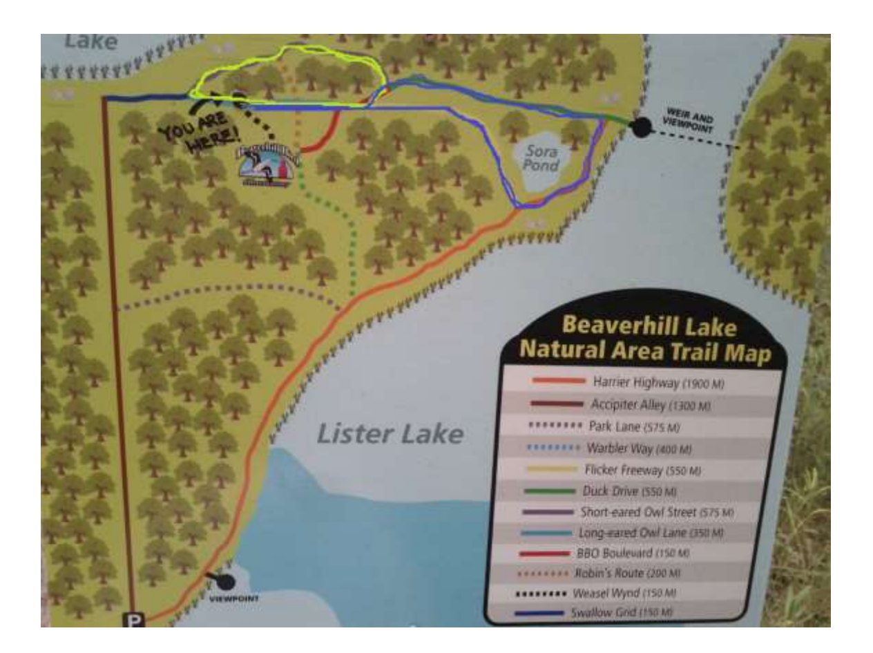
Figure 1. The location of Route A highlighted in Green, and Route B highlighted in Blue within the Beaverhill Natural Area.

unidentified. The surveys took approximately 1-2 hours depending on weather and the time allocated to catch unknown species.