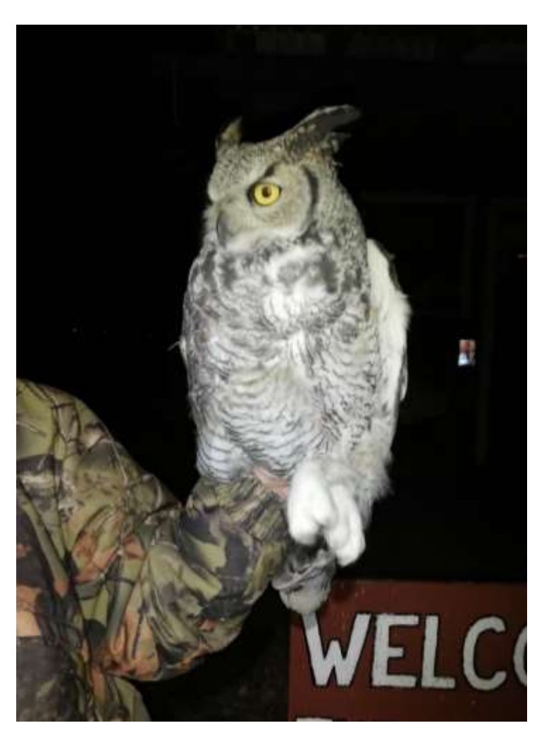
A Great- horned Owl that was banded at BBO this autumn.

825.35 playback hours were accumulated (357.4 playback hours of the Northern Saw-whet Owl call, 336.95 playback hours of the Long-eared Owl call and 131 playback hours of the Boreal Owl call) this autumn. For a total of 322 owl captures (295 Northern Saw-whet Owls, 26 Long-eared Owls, and 1 Great-horned Owl) which resulted in a capture rate of 39 owls/100 playback hours (Table 3).