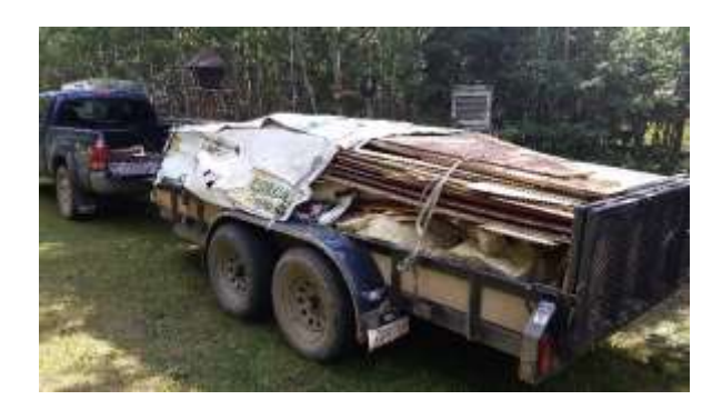
The demolition of Raven's Roost took only 4 hours of effort with a dedicated group of volunteers to be loaded onto John Scott's trailer and headed to the Ryley dump. Some of the lumber and insulation was saved and used to insulate Nuthatch Nest.