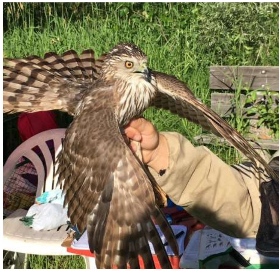
Cooper's Hawk caught at LILA