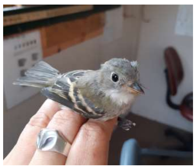
Least Flycatcher caught at BLAB

BLAB had another record slow season in 30 years of banding, with a total of 54 birds captured, of 10 different species. With an effort of 310 net hours, we had a capture rate of 17.4 birds per 100 net hours. Least Flycatchers were dominating this station with 36 captures, representing 65% of all birds caught. We also caught a few American Robins (5), Black-capped Chickadees (4), Rose-breasted Grosbeaks (3) and only one of the following: Baltimore Oriole, Cedar Waxwing, House Wren, Red-winged Blackbird, Warbling Vireo and a Tennessee Warbler.