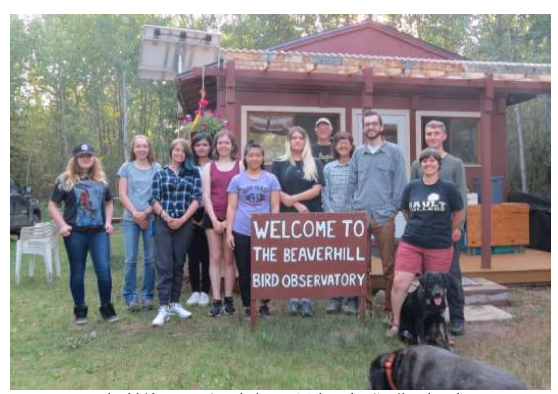
The 2018 Young Ornithologists!