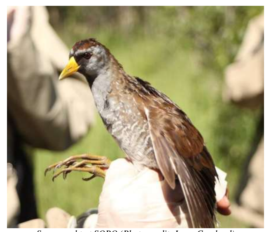
Sora caught at SOPO

At SOPO we captured 317 birds over 330 hours, producing a capture rate of 96.1 birds per 100 net hours. A total of 29 different species were caught, the two most common were Black-capped Chickadees (63) and Least Flycatchers (63). The next most abundant species captured this year was Yellow Warbler (51), followed by Song Sparrow (27), Warbling Vireo (14), Clay-coloured Sparrow (11) and Red-winged Blackbird (11). Other species of interest included Cedar Waxwing (4), Marsh Wren (4), LeConte's Sparrow (3), Lincoln's Sparrow (3), Northern Waterthrush (3) and Sora (1).