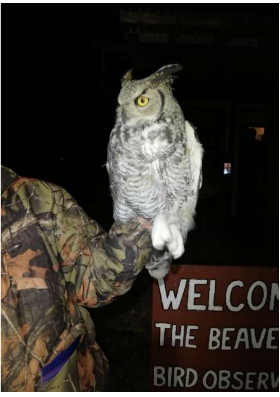
A Great-horned Owl that was banded at BBO this autumn.