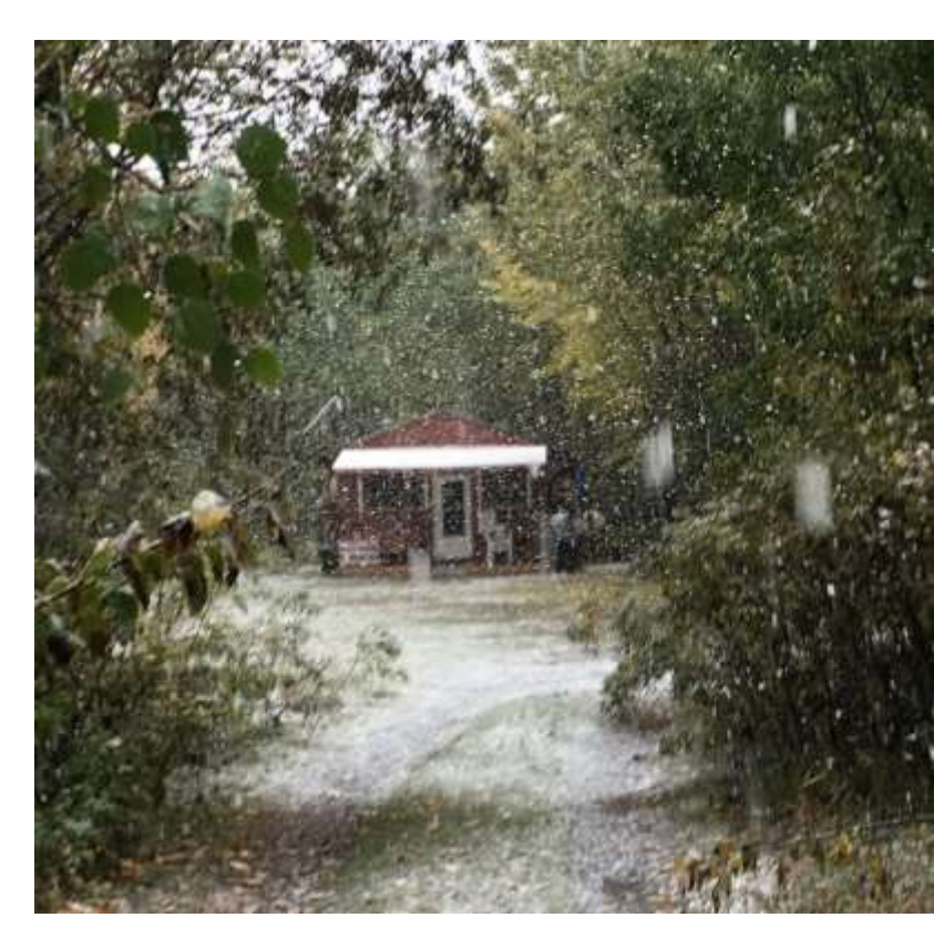
Right: Snowing at the BBO!

So all of this cold weather meant instead of banding, BBO staff conducted a double census (even in the snow!) daily and just got to watch all the brave birds flying by in the unpleasant weather. The one good thing that has come from all this wet weather is that it has given BBO staff plenty of time to get caught up on data entry, updates, report editing and working on grant writing! So hurray for getting caught up on office work!!!