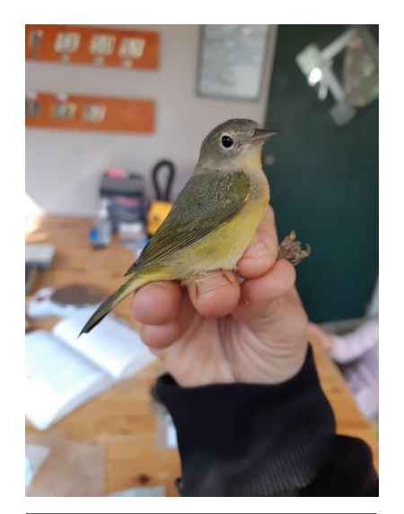
A Nashville Warbler!

Other awesome sightings around the BBO have been Peregrine Falcons and Merlins near Volunteer Parking. There also have been numerous warblers hanging out in the treetops near the lab. Plus, staff have also seen 3 juvenile Northern Sawwhet Owls near the lab perched in spruce trees. These 3 owls