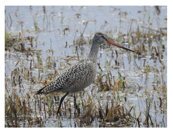
Marbled Godwit at Kallal Meadow

has been an exciting week out at the BBO!