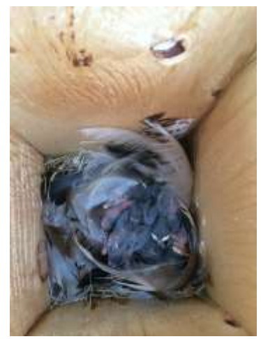
Figure 4. Tree Swallow Chicks, about age 6 days. Cute little beaks in a pile of feathers!

breeding tree swallows. In the nest boxes occupied by tree swallows, a nest is found made of grasses with a feather-lined cup to lay eggs into (Audubon). On our trail tree swallow nesting began in the beginning of May, around May 4, with the first laid eggs near the middle of May, about May 19. According to the National Audubon Society of Birds (2014), tree swallows have a clutch size between four and six whitecolored eggs; on the mountain bluebird trail surveyed,