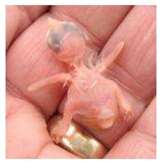
Figure 3. Newly hatched (day 1) tree swallow chick (C. Gates).

much about tree swallows? Well, while monitoring the mountain bluebird trail only two mountain bluebirds nested in our nest boxes, otherwise it was tree swallows, house