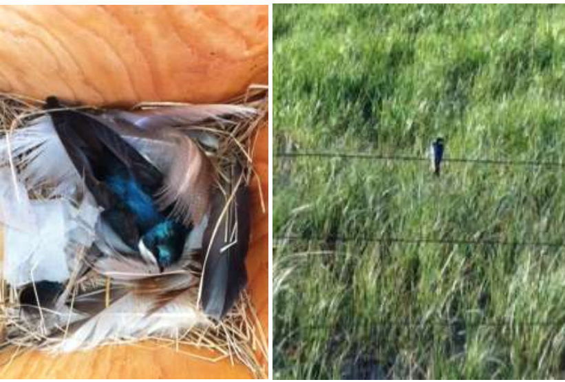
Figure 1. Tree Swallows

If ever you've looked into a beautiful Albertan summer sky, you have likely seen a tree swallow (Tachycineta bicolor),