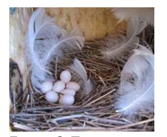
Figure 2. Tree Swallow Eggs. Note white color, and nest structure. (C. Gates).

The Beaverhill Bird Observatory runs a nest box program for many species of