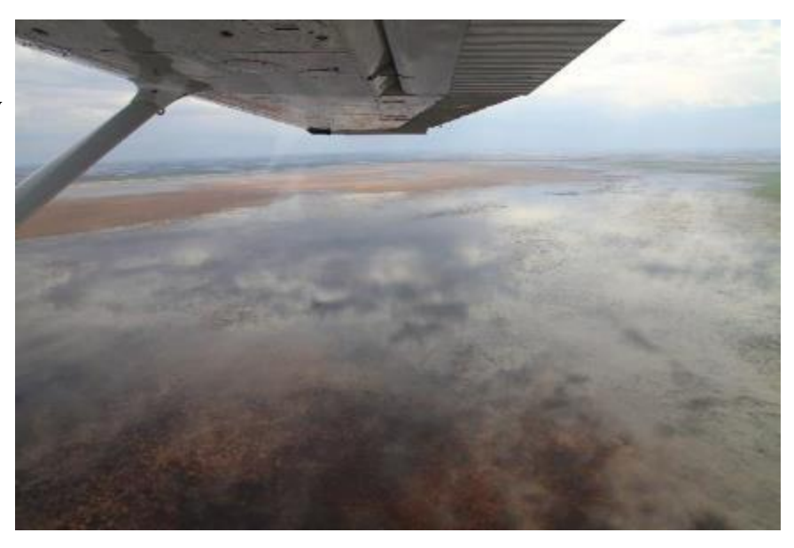
Photo on Right: Beaverhill Lake from the East shore looking South.

Then on May 10<sup>th</sup>, the BBO staff flew an aerial survey of Beaverhill Lake to better document the extent of the water and estimated that 70% of the historical lakebed was flooded with 50% containing open water (BBO 2017).