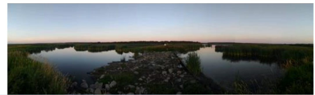
August 9, 2017