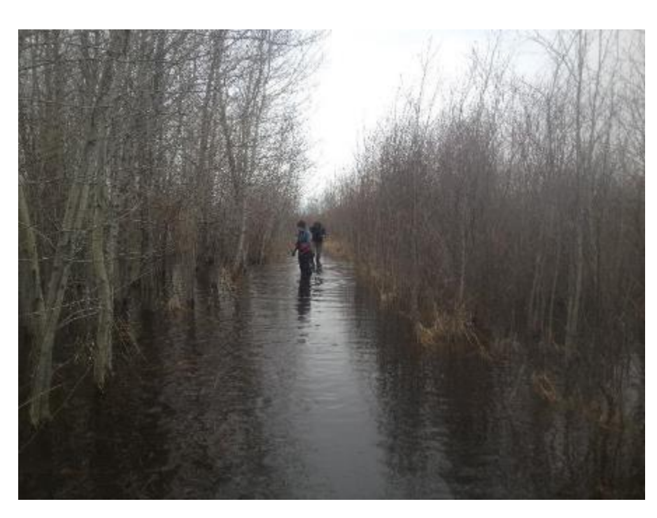
Photo on Right: BBO Staff and volunteers walking down Duck Drive on April 1st 2017.

grassy "Duck Drive", a trail that parallels the Beaverhill lake bed, was inundated with water flowing into the lake at levels deeper than 30 cm, unfortunately just above the levels of rubber boots! The weir, which normally receives a trickle of water, was overflowing with large volumes of water re-filling the lake.