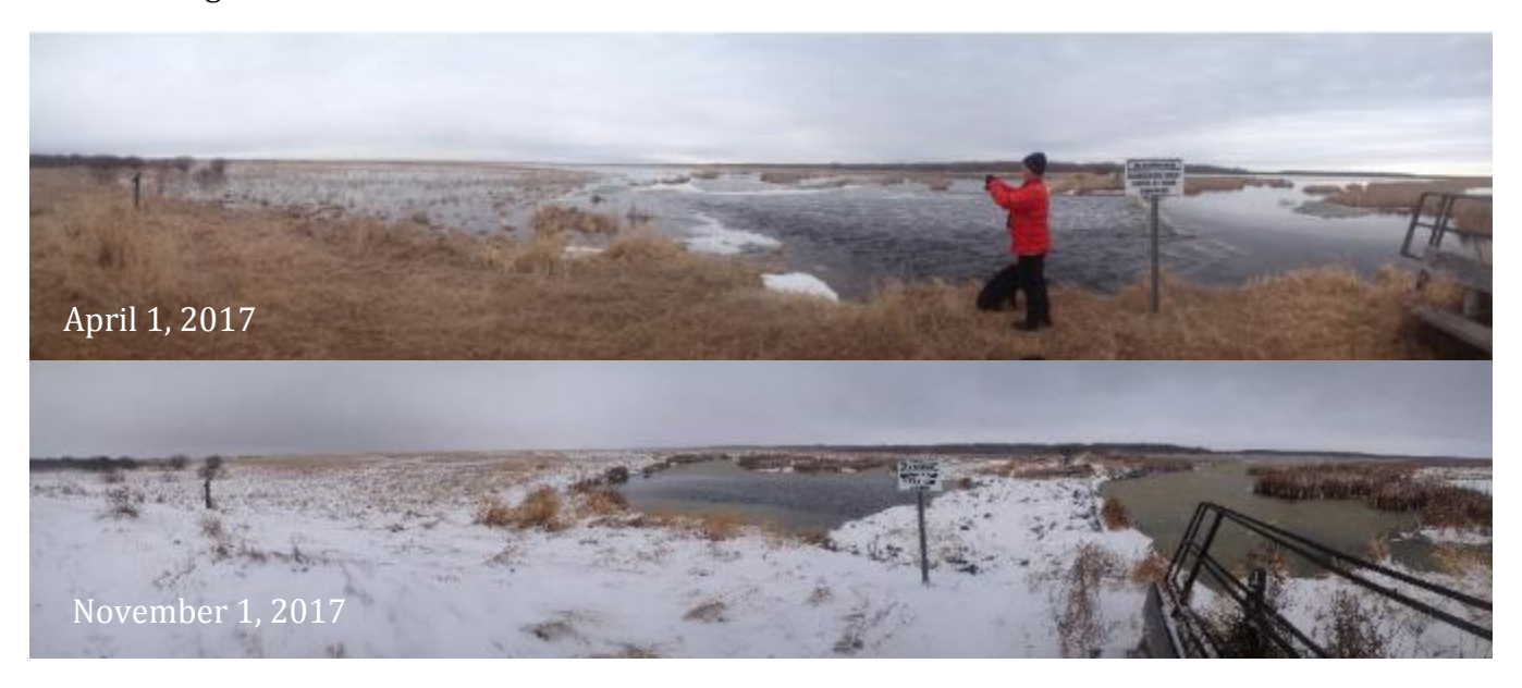
See Appendix 1 for the full photographic documentation.

Throughout the spring, summer and fall seasons, I photographed the water levels at the weir between Lister and Beaverhill Lakes to document the seasonal changes.