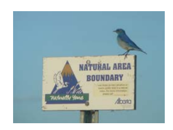
A bluebird shows off the Natural Area