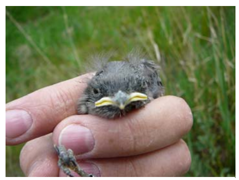
Bluebird nestling showing off his Einstein look (and big yellow gape)