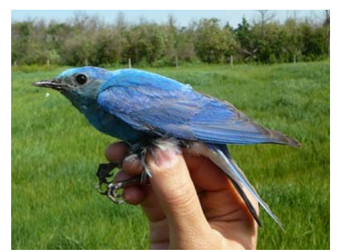
Male Mountain Bluebird