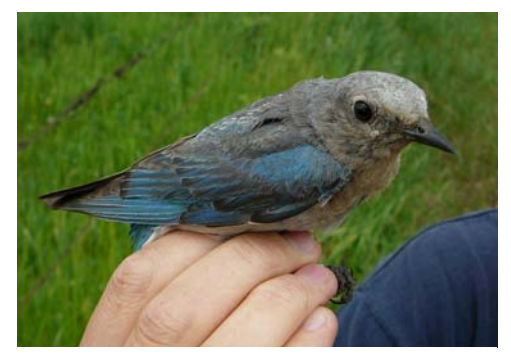
Female Mountain Bluebird