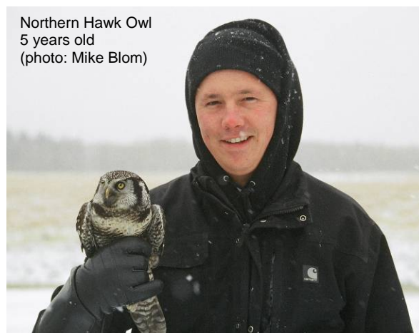
Northern Hawk Owl 5 years old